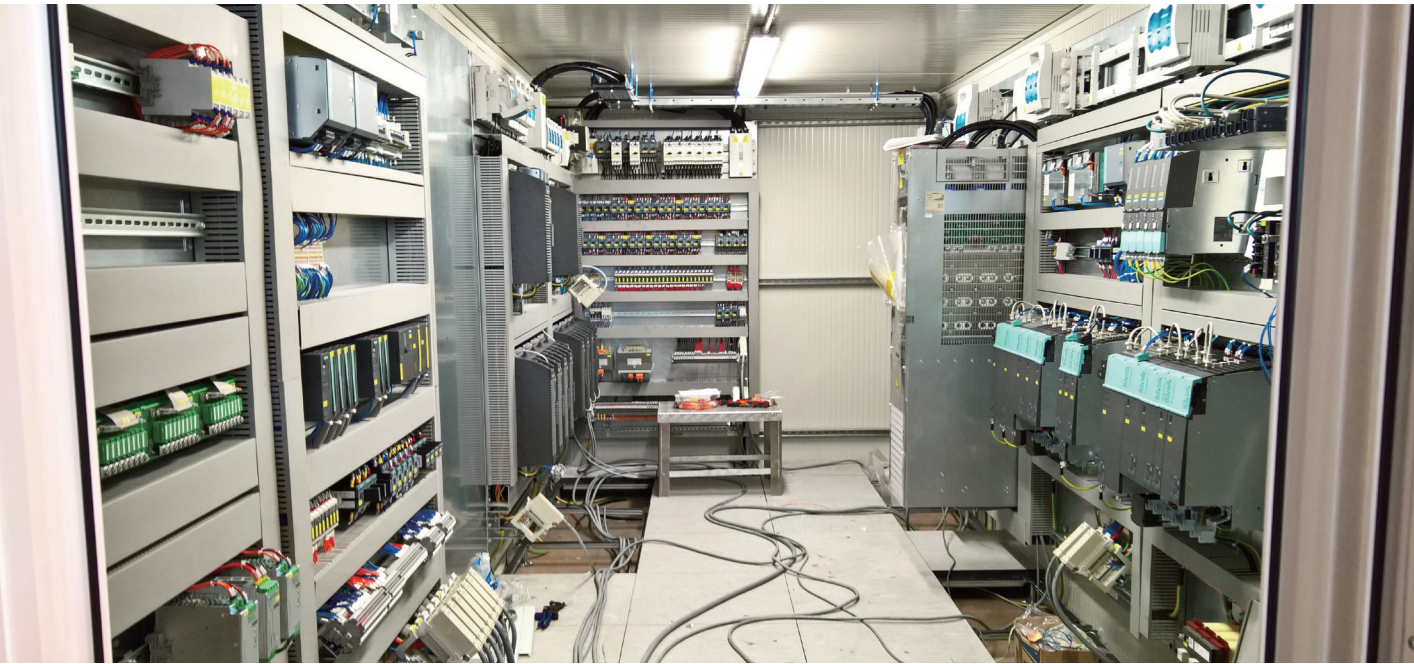
Electrical panel in container - 800kW of total power