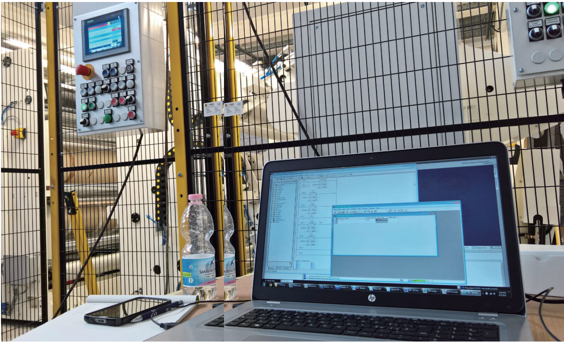
Phase of commissioning of an industrial plant