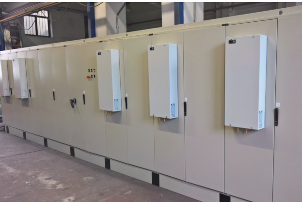
Construction Large Control Panels