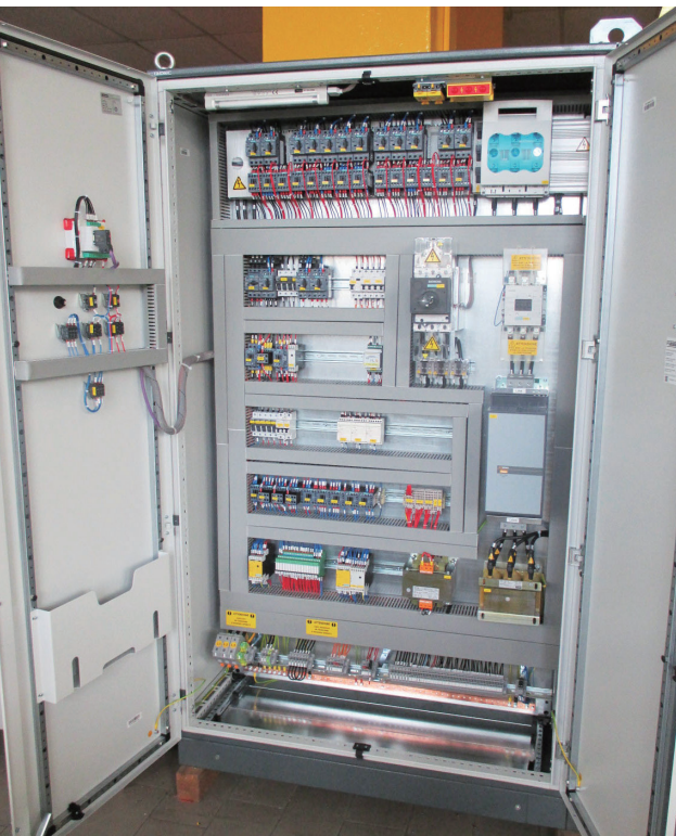
Control Panel according to CE standards

Realizing the electrical installation part of the interface between the switchboard and the machine is a highly specialized job, which requires qualified personnel who can easily operate the various types of machines and systems. For years Franzosi has created all the connections necessary for putting machines into service.